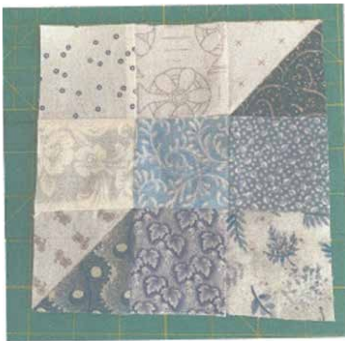
Steps to make Half-Square Triangle