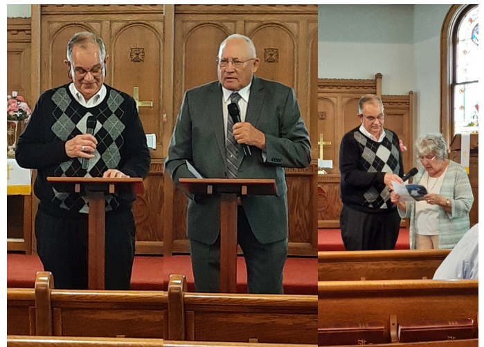
Rural Life Sunday Photos

***If your county is interested in hosting Rural Life Sunday next year, please let me know. That date will be May 5, 2024. ***